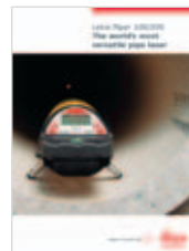
Leica Piper 100/200 Product brochure