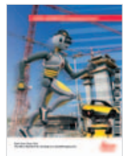
Leica Sprinter Product brochure