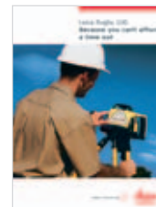
Leica Rugby 100 Product brochure