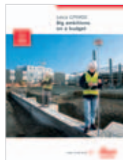
Leica GPS900 Product brochure

Distance meter (fine/fast): Laser class 1 in accordance with IEC 60825-1 resp. EN 60825-1