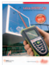
Leica DISTO A8 Product brochure